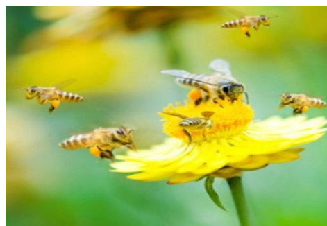
Fig.2: Flower Pollination