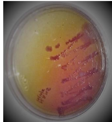
Fig.2. Brown color indicating laccase