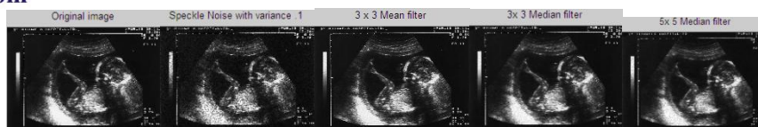
Fig. 7. Effect of filter on Speckle noise with variance 0.1 on image2