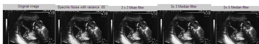
Fig. 6. Effect of filter on Speckle noise with variance 0.05 on image2