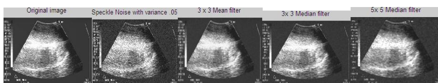
Fig. 3. Effect of filters on Speckle noise with variance 0.05 on image1