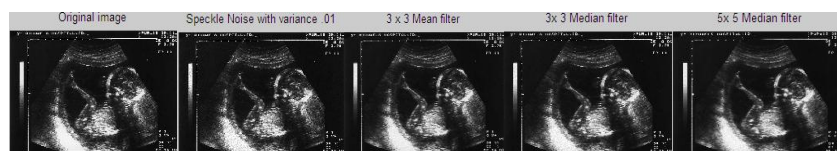
Fig. 5. Effect of filter on Speckle noise with variance 0.01 on image2