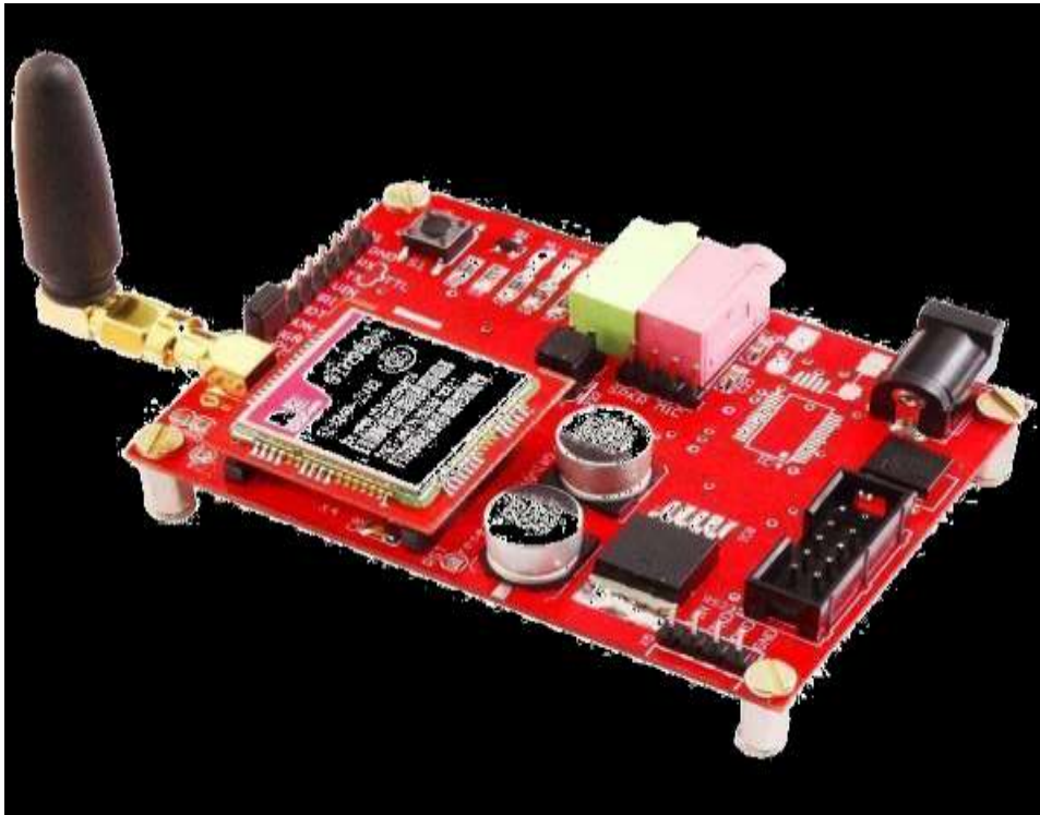
FIG.4 GSM module IC