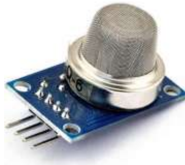
Fig. 2 MQ-6

The power need by the sensor is 5V. This sensor has different resistance value in different concentration. For an example, if we calibrate the MQ-6 gas sensor to the 1000ppm of propane