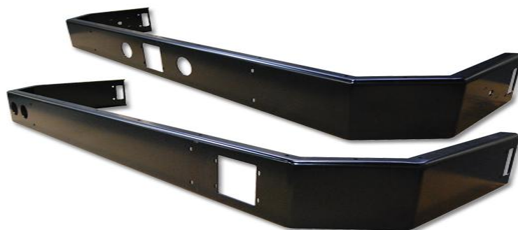
Fig (3) Painted Steel bumper

Steel front bumper are mostly used in off road vehicles which has a coating to influence the corrosion life of the bumper. Steel is often e-coated and then painted or powder-coated. Steel bumpers that are made of bare steel and are then e-coated after the forming process. Some steels are coated with zinc which improves the life of the steel by discouraging or preventing corrosion.