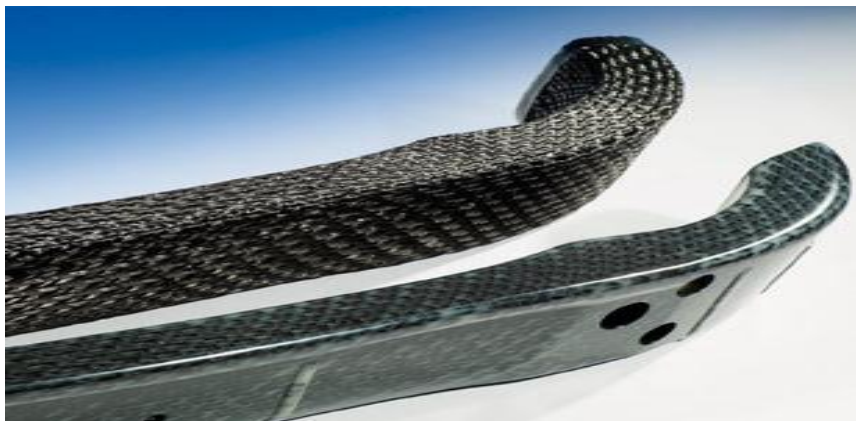
Fig (1) Carbon Fiber Reinforced Polymer Bumper

Carbon fiber reinforced polymer or often carbon fiber is an extremely strong and light fiber-reinforced plastic which contains carbon fibers. Polymers that are usually used for binding are mainly thermoset resins. Epoxy is one of the thermoset resin. Sometimes in some cases other thermoset or thermoplastic polymer is also used. Such polymers are polyester, vinyl ester or nylon. The required strength and rigidity of a carbon fiber reinforced polymer is obtained from reinforcement which is measured by stress and elastic modulus accordingly. Unlike isotropic materials like steel and aluminum, CFRP has directional properties.