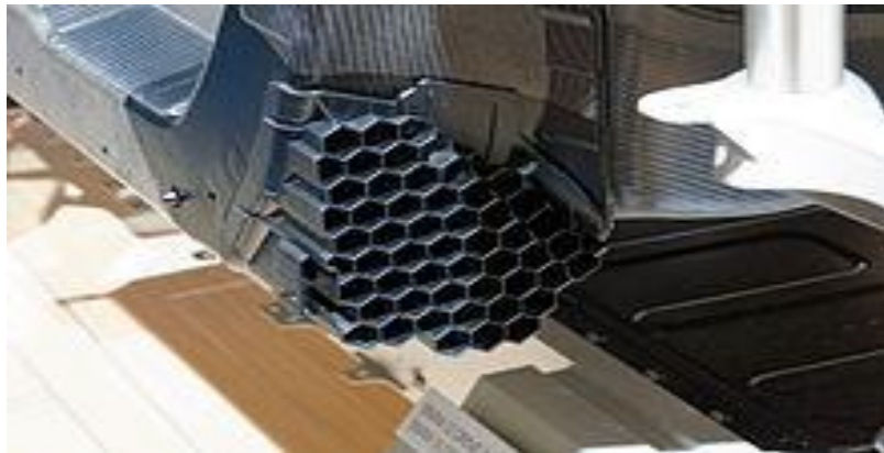
Fig (2) Aluminum Honeycomb Bumper

This type of construction consists of thin two facing layers separated by a core material. The aluminum honeycomb panel provides light weight, high rigidity and high structural stability.