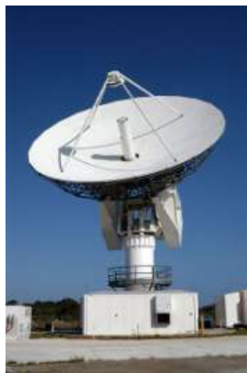
Fig (2) 50 Feet dish Antenna of an 3 kW C-band Radar

Radio and television broadcast stations transmit their signals via RF electromagnetic waves. Broadcast stations transmit at various RF frequencies, depending on the channel, ranging from about 550 kHz for AM radio up to about 800 MHz for some UHF television stations. Frequencies for FM radio and VHF television lie in between these two extremes. Operating powers can be as little as a few hundred watts for some radio stations or up to millions of watts for certain television stations. Some of these signals can be a significant source of RF energy in the local environment, and the FCC requires that broadcast stations submit evidence of compliance with FCC RF guidelines.