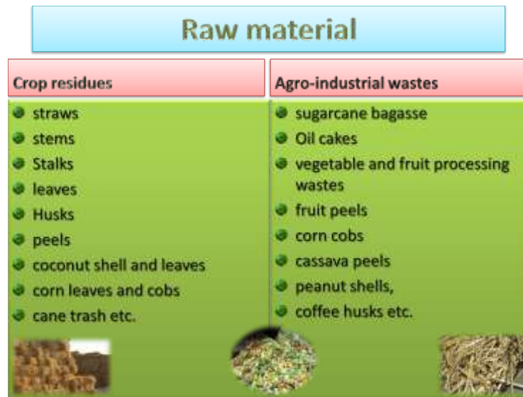
Fig.1. Raw materials