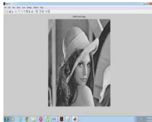
Figure 4.1: Original image of Lena Figure 4.2: AWGN of Lena image