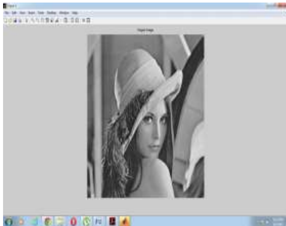
Figure 4.7: Original image of lena