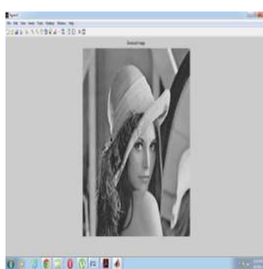
Figure 4.12: De-noising image