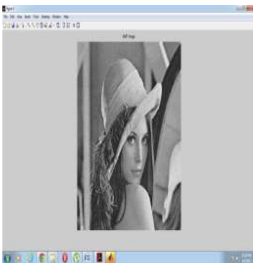
Figure 4.11: AMF of Lena image after SPIN+RVIN