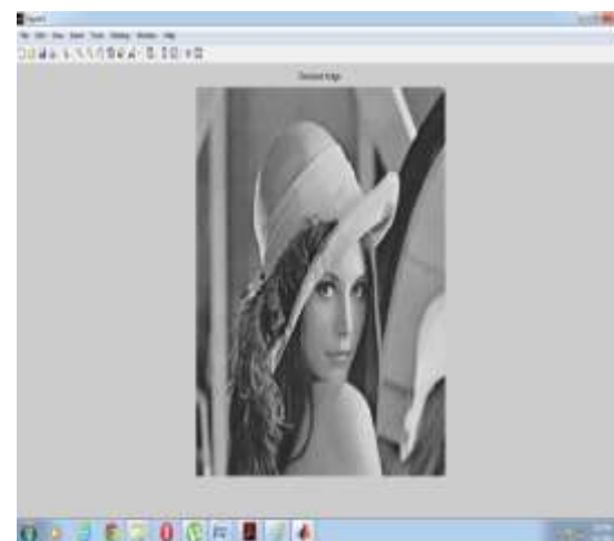
Figure 4.5: AMF of Lena image after SPN Figure 4.6: Denoised of Lena image