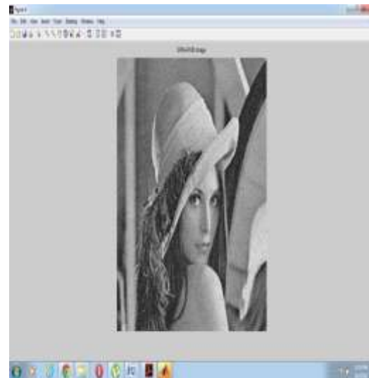
Figure 4.10: SPIN+RVIN of Lena image