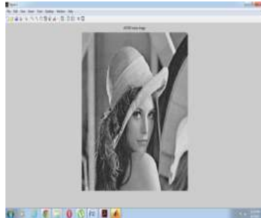
Figure 4.8: AWGN of Lena image