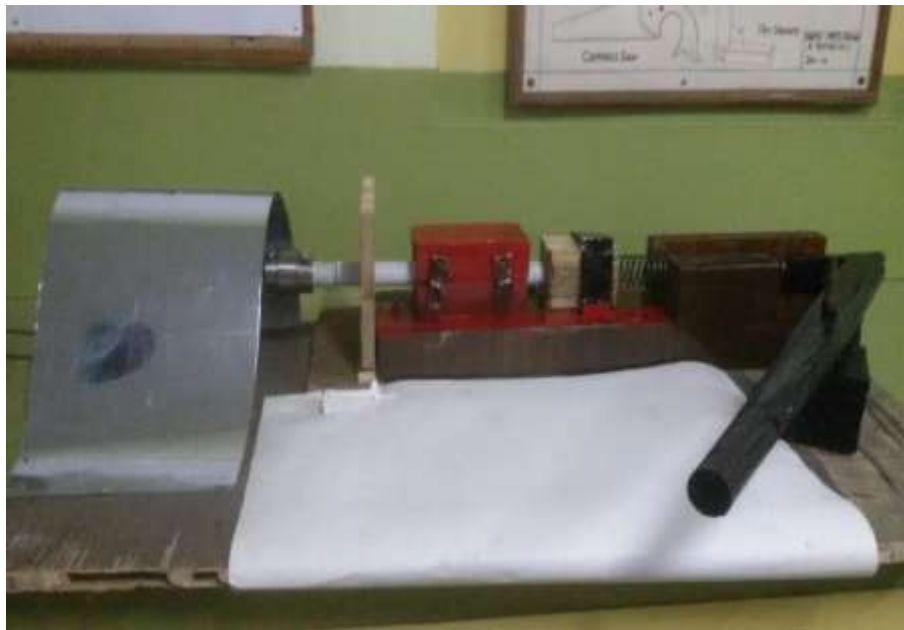
Fig. 1: Welding Setup

An image of setup used for producing required welds is shown in figure 1.