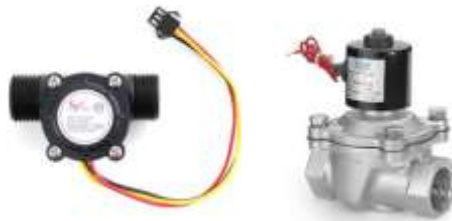
Fig. 3 Flow sensor & Solenoid valve

Flow sensor and solenoid valve are used to measure the quantity of edible oil and kerosene. At the output of flow sensor we get pulses using those pulses we are controller flow of liquid. Solenoid valve is used to ON and OFF the flow of oil or kerosene. Both are operated on 12V DC supply.