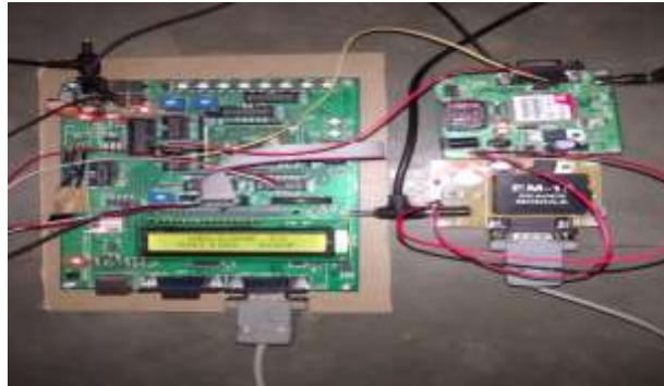
Fig. 5 Interfacing of RFID and GSM

When card is placed in front of RFID module then generated signal is given to controller. Controller will identify the costumer as shown in fig 5 and it will display the name of costumer. After completion of each transaction SMS is delivered to each consumer using GSM [4] .