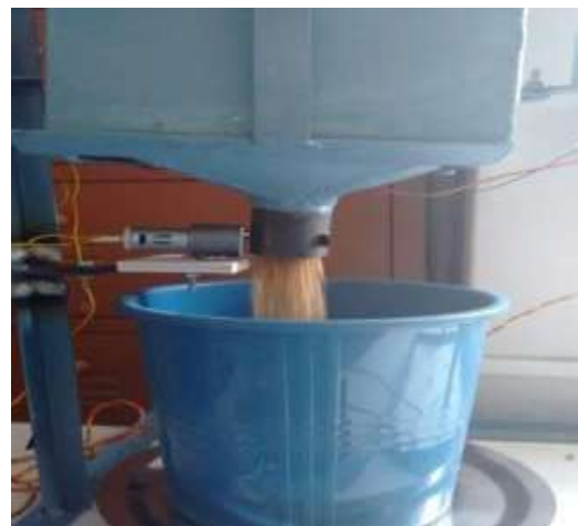
Fig. 6 Grain drawn from system

Interfacing of DC motor and LPC248 using L293D IC, IC L293D provides proper matching between motor and LPC2148. Features of high torque 12V DC geared motor 10 RPM are