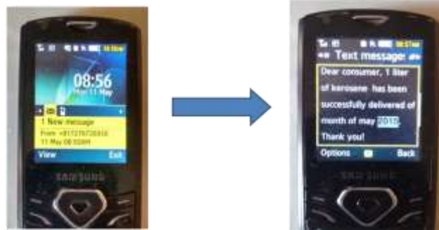
Fig. 7 Delivered message on consumer mobile