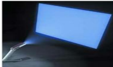
Fig.5 Diagram of Digital Camera

In this device, the digital camera is in the shape of a pen and used for recording video, video conferencing and much more. It is simply named as a web cam and is a 360 0 virtual machine used for an exchange of information.