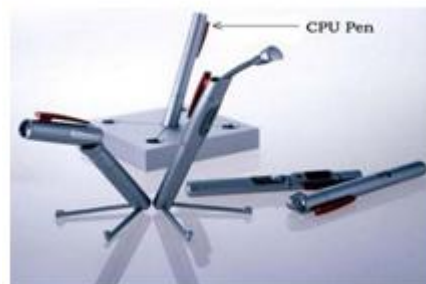
Fig.2. Diagram of CPU pen