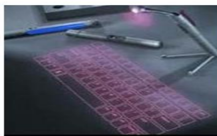
Fig.6 Diagram of Led Projector

The role of monitor is taken by LED Projector which projects on the screen. Thus it gives more clarity and good picture. This device plays the role of a monitor by availing the LED projector and projects the screen. It consists of a resolution capacity of a screen about 1024*768 and furnishes excellent clarity.