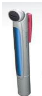
Fig.3 Diagram of Communication Pen

The whole set up of the device can connect to Bluetooth or the internet and the communication pen has the cellular network which has a huge number of portable transceivers. They are used in covering a large area at the same time and also decrease the interference of the other signals.