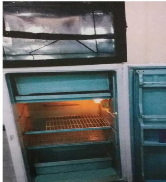
Fig.3 Experimental setup

The maximum temperature of the chamber can be as high as 50 ° C, and the average temperature will be around 40 ° C, which is more than sufficient for most of the domestic food warming kind of applications.[4]