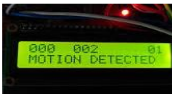
Figure 3B. LCD display showing the intruder detection.