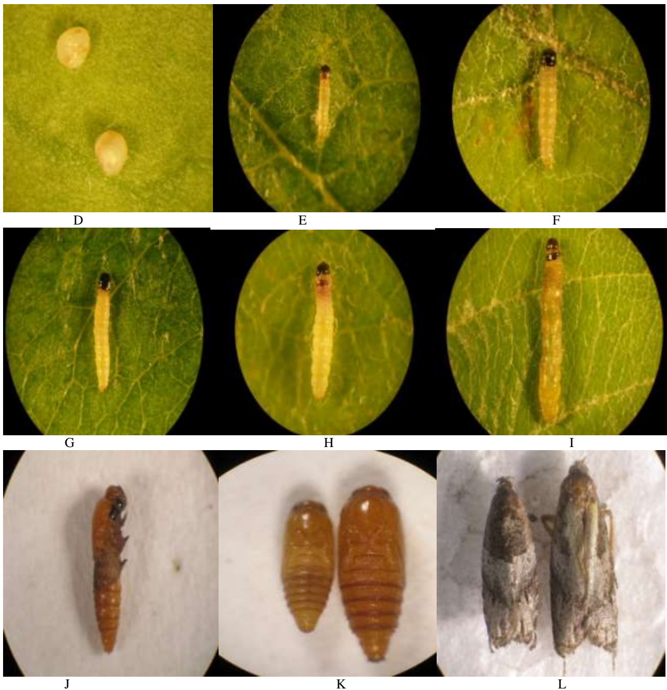
Fig- 1: A. Culture inside cage, B. Pupae obtained from culture, C. Rearing inside cage, D. Freshly laid eggs, E. 1 ST instar larvae, F. 2 nd instar larvae, G. 3 rd instar larvae, H. 4 th instar larvae, I. 5 th instar larvae, J. Prepupa, K. Pupa, L. Adult moth.